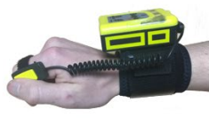
Comfort wrist strap