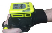
No-finger glove to wear on the back of the hand