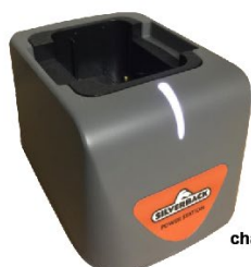
1 slot charging cradle