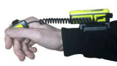
Strap for jacket sleeve