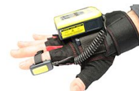
Half-finger glove to wear on the back of the hand