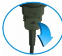
Interchangeable cable with HRS connector