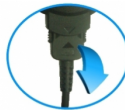
Interchangeable cable with HRS connector